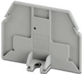
End cover, length: 53.3 mm, width: 2.2 mm, height: 37 mm, color: gray

Please be informed that the data shown in this PDF Document is generated from our Online Catalog. Please find the complete data in the user's documentation. Our General Terms of Use for Downloads are valid ( http://phoenixcontact.com/download )